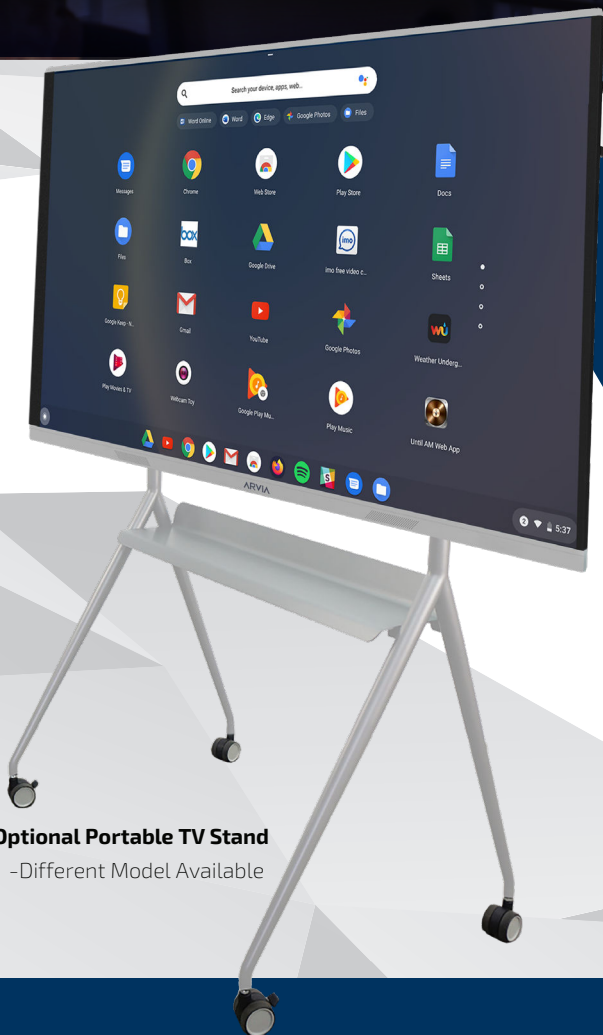
Optional Portable TV Stand -Different Model Available

ARV500 Series : Sizes 55", 65", 75", 86" Excellent companion in Google Workspace for Education