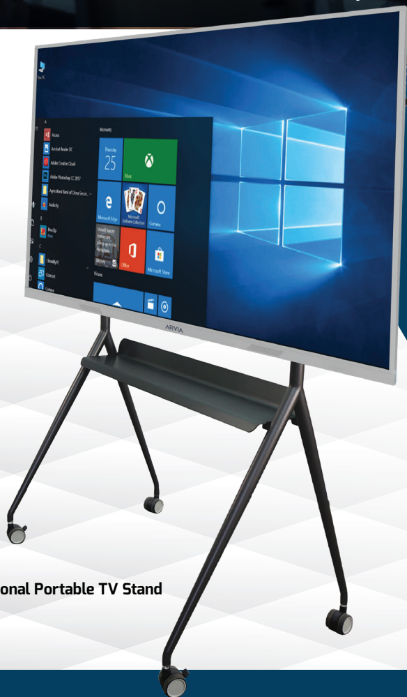
Optional Portable TV Stand

Multi Touch with zero bonding technology