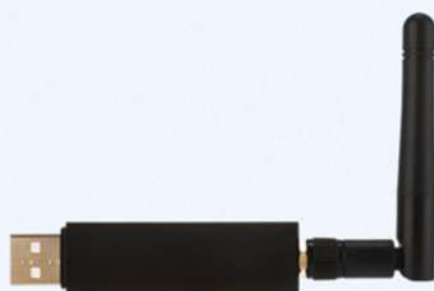
2.4G wireless USB adapter